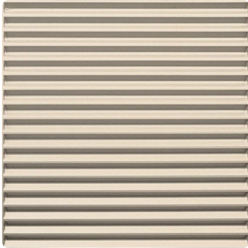
Drop-in ceiling tile.