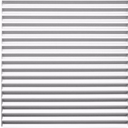
Drop-in ceiling tile.