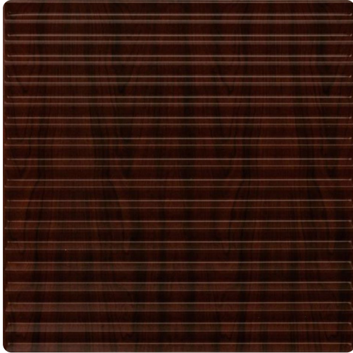
Drop-in ceiling tile.