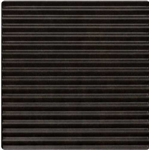
Drop-in ceiling tile.