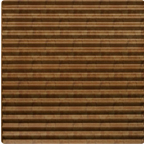
Drop-in ceiling tile.