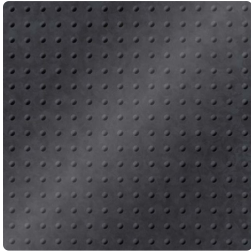
Drop-in ceiling tile.